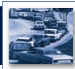
Price of gas skyrockets to 63 cents per gallon

The principals of US Door & Building Components enter the storage industry as Roll-Lite® Storage Systems in Orlando, on a mission to go beyond the conventional building standards for mini-storage facilities.