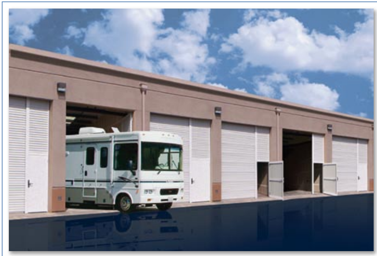
2006 US Door introduces the EZ-Access Door for boat and RV storage, or commercial and industrial condominiums.

...the Company Setting the Industry Standard.