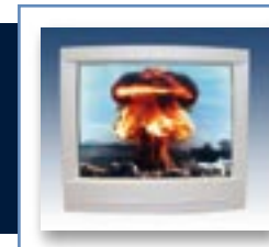
World prepares for Y2K computer glitch

US Door incorporates and expands to Arizona in order to build on the established reputation its principals have developed, for excellence in customer service and cutting-edge product innovation.