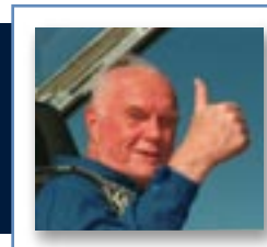
John Glenn returns to space on Space Shuttle Discovery

The engineering crew, now on board with US Door, designs a Windload door that withstood Hurricane Andrew force winds, and quickly became the industry benchmark for windload doors.